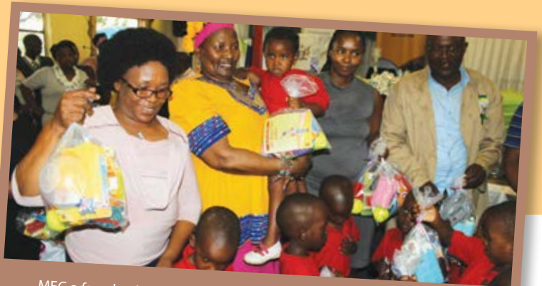
MEC o fane ka dibapadiswa ho Setsi sa Bana ba Lokisetwang Sekolo