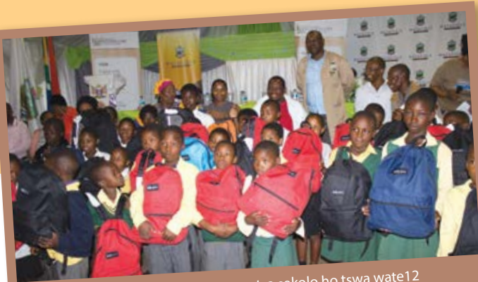
Bakgolamolemo ba diaparo tsa sekolo ho tswa wate12 Seterekeng sa Alfred Nzo

Sepheo sa letsholo e ne e le ho fihlella bahloki le bana ba mathateng, ho ba thusa ka dinthwananthwana tsa tshehetso hore ba kgone ho kena sekolo selemong sena sa dithuto ntle le ho kgethollwa. Letsholo lena hape le batla ho netefatsa hore le bana ba hlahang maemong a hlokanngenyetla le bona ba fumana menyetla e tshwanang.