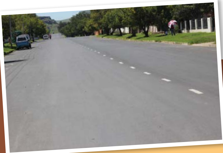
Masepala ka Lefapha la Ditshebeletso tsa Meralo ya Motheo o hlabotse ka katleho Seterata sa High wate 19.