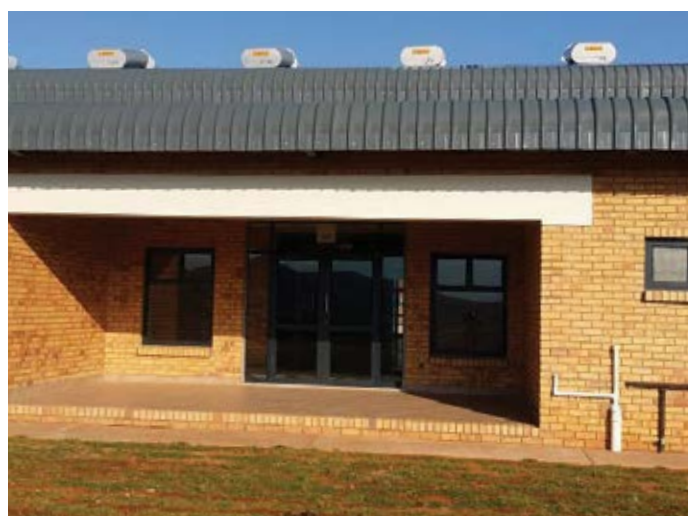
Setsi sa maemo sa R22 Milione sa Thusong Service Centre se phetetswe Tulong ya Ma-benyeng (Thaba Chicha) lebatoweng la 14