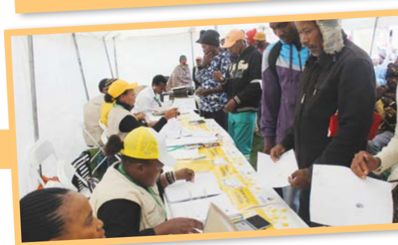
SASSA officials assisting food parcels beneficiaries