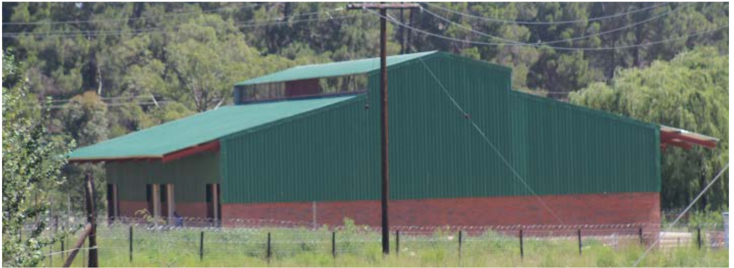
Kaho ya Mmaraka wa Matatiele ka hara wate 19 e motjheng

M maraka o sa tswa ahuwa o fumaneha kamora Cash Build ya kgale