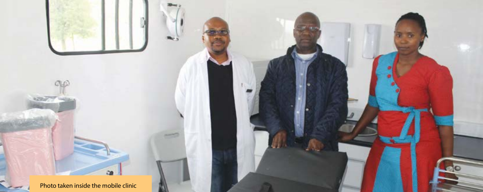
Photo taken inside the mobile clinic