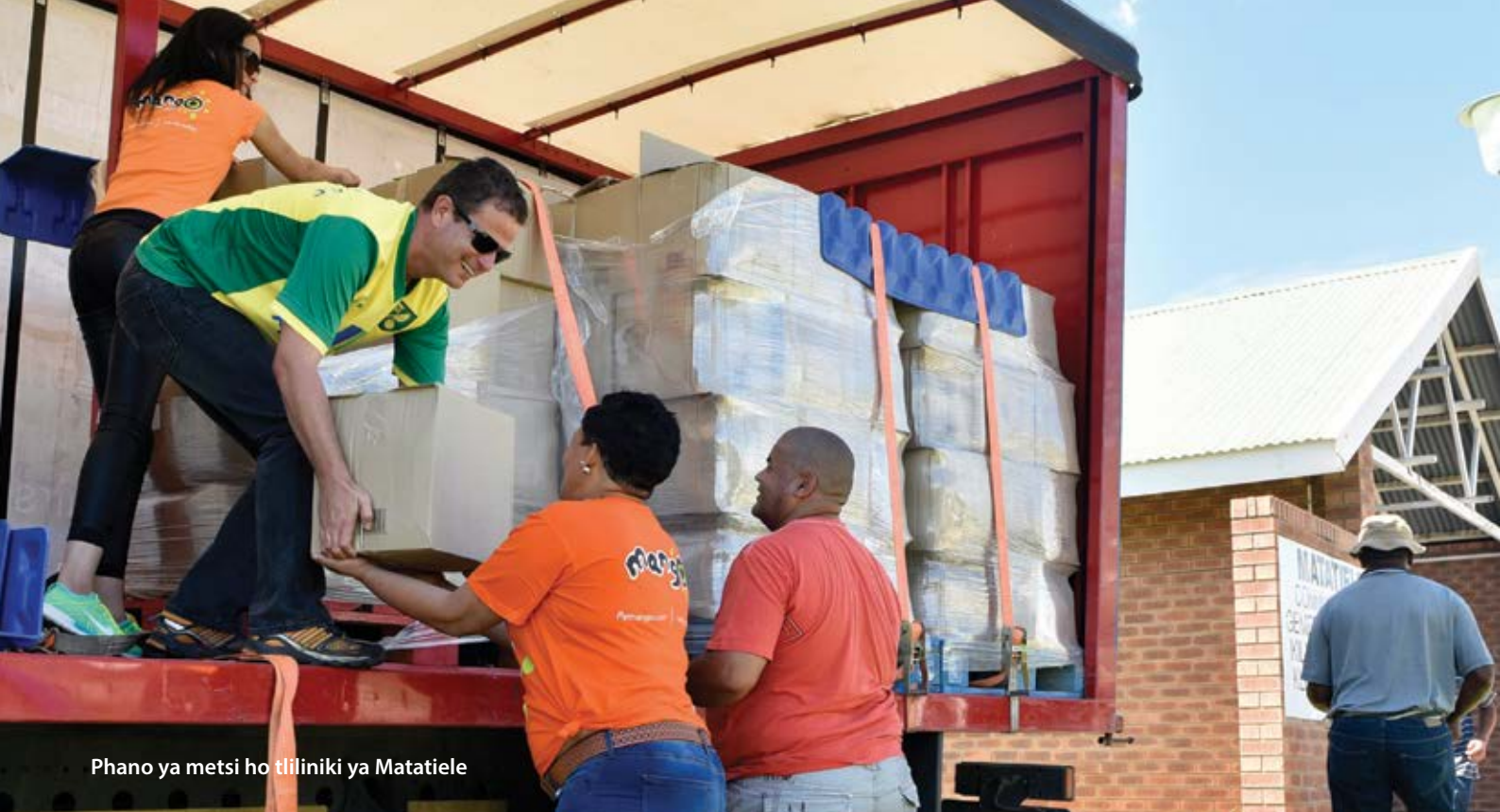
Phano ya metsi ho tliiniki ya Matatiele