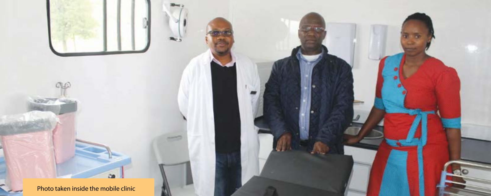
Photo taken inside the mobile clinic