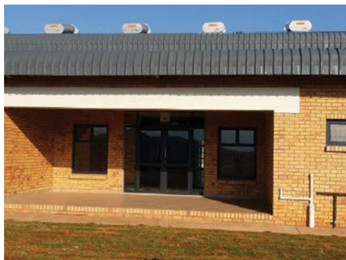
R22 Million state of the art Thusong Service Centre at Ma-benyeng Area (Thaba Chicha) in ward 14