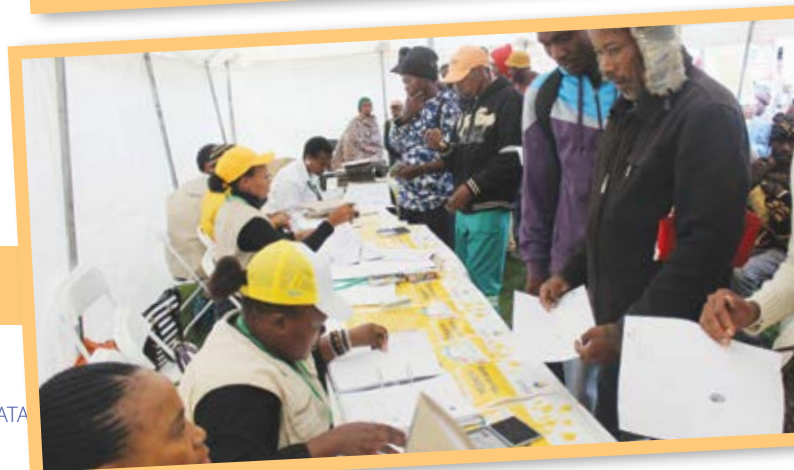
SASSA officials assisting food parcels beneficiaries