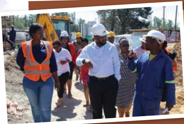
Matatiele Local Municipality political leadership and Management accompanied by media visited multi million construction project of Social Development offices for Matatiele Area Office. Through this project, jobs were created for local people.