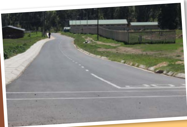
Internal streets at Itsokolele were constructed