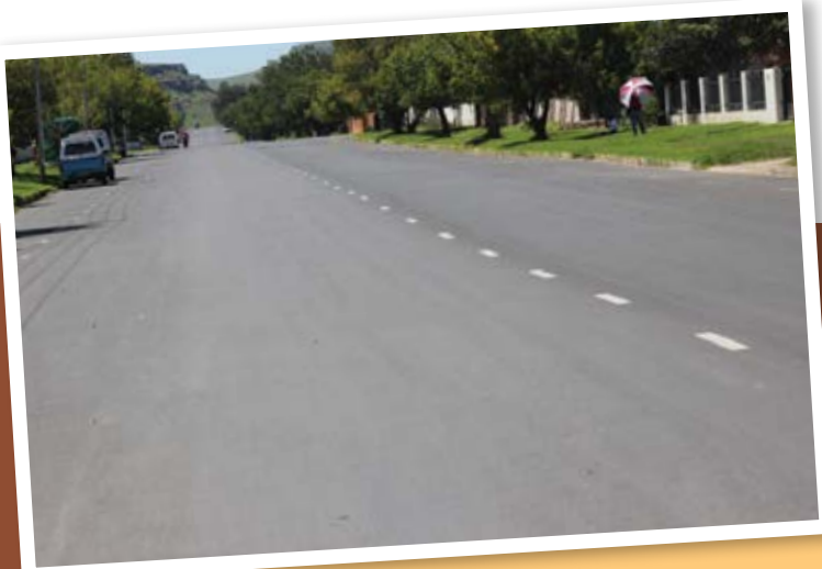
The Municipality through the Infrastructure Services Department had successfully managed to refurbish High Street in ward 19.