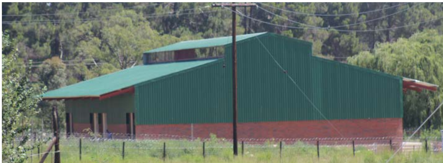
Construction of Matatiele Fresh Produce Market in ward 19 is underway

Newly constructed Fresh Produce Market situated behind Old Cash Build