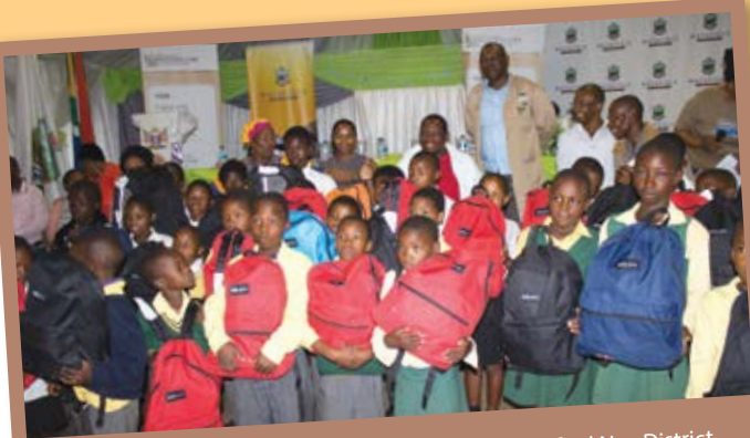
School uniform beneficiaries from ward 12 and Alfred Nzo District

The campaign was aimed at reaching out the needy and vulnerable children, assist them with material support in order for them to attend school in this academic year without any segregation. The Campaign also seeks to ensure that even those learners from disadvantaged backgrounds have an equal opportunity.