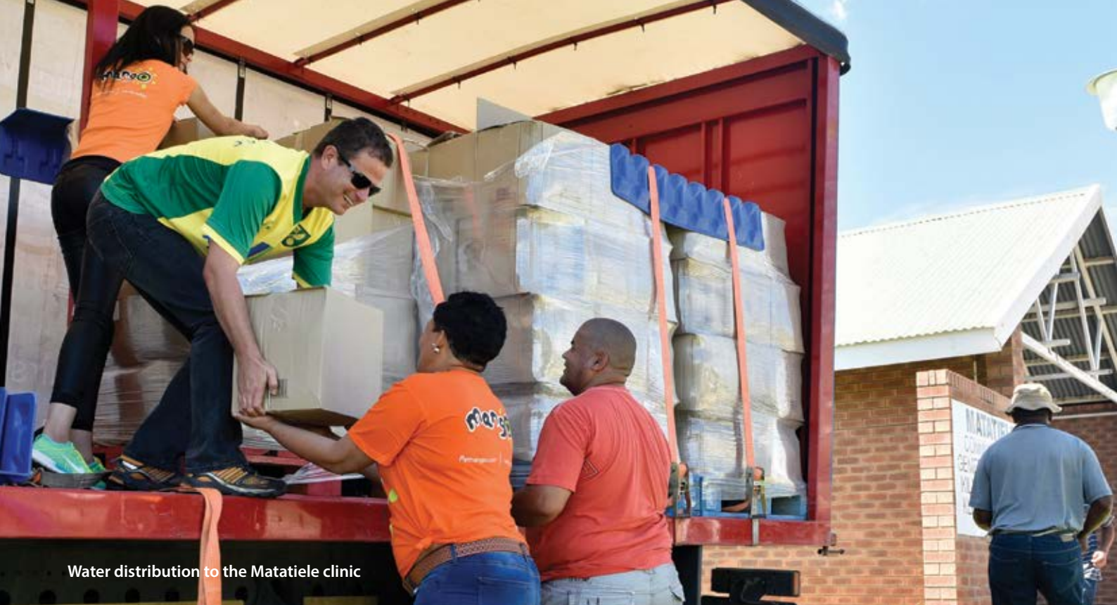
Water distribution to the Matatiele clinic